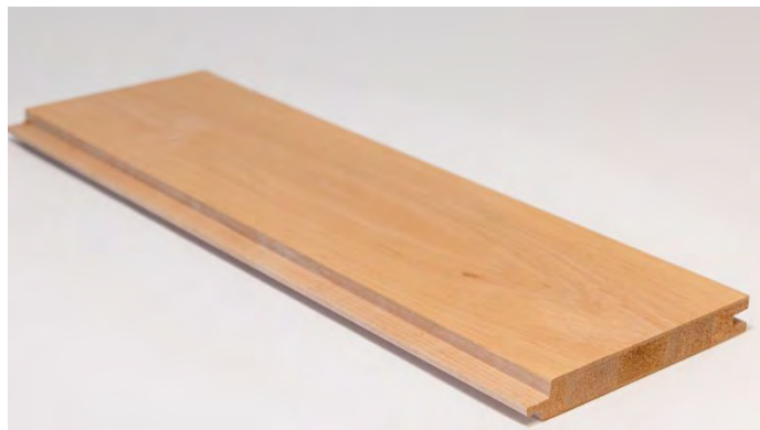
STS3 veneered Alder 15x120 mm