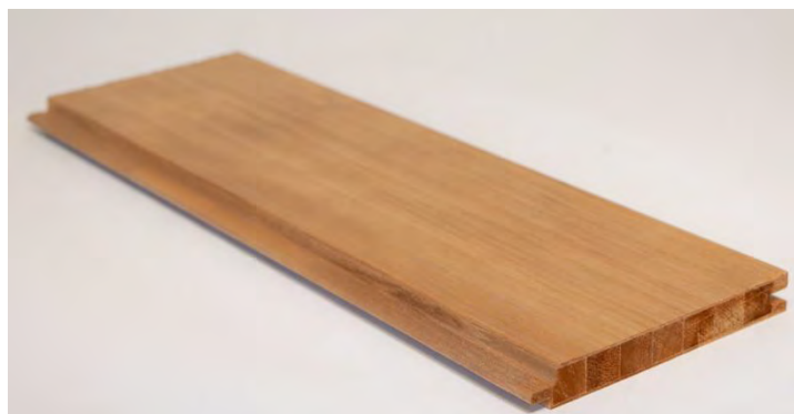
STS3 veneered Thermo Aspen 15x120 mm