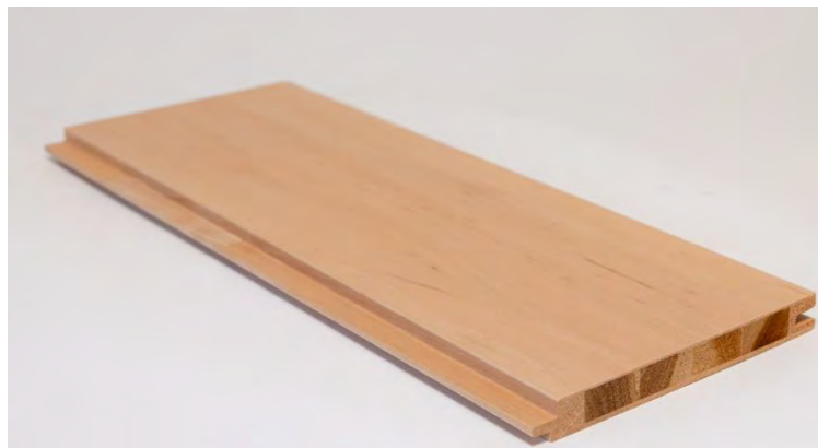
STS3 veneered Alder 15x140 mm