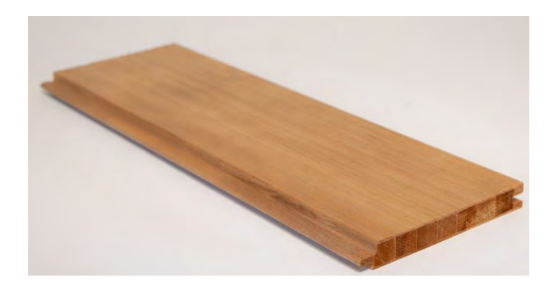
STS3 veneered Thermo Aspen 15x140 mm