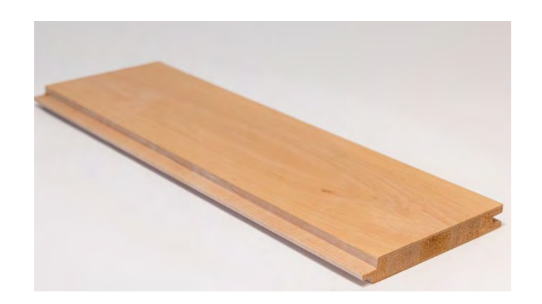
STS3 veneered Alder 15x140 mm